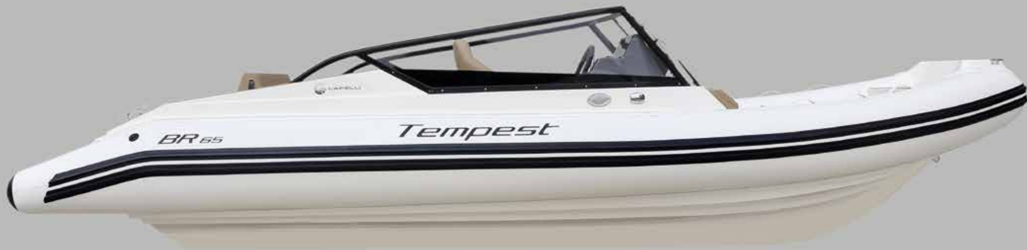
New version 2021-2022